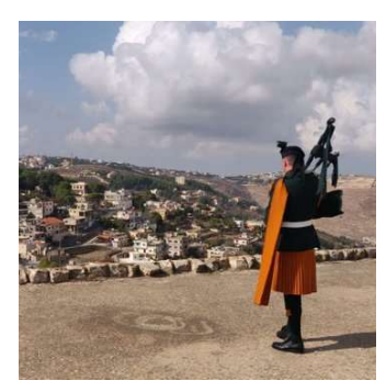
<u>02 November</u>: Personnel who were on their first overseas tour of duty were presented with their UNIFIL medals in Tibnine Castle.