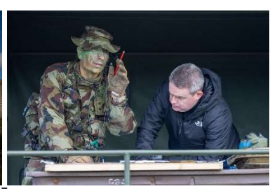
<u>9/10 November - Kilworth – Operational Capability Assessment</u>: Corps assets supporting 1 Brigade Artillery Regiment