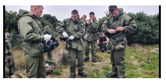
01 October: CBRN refresher training in Kilworth Camp.