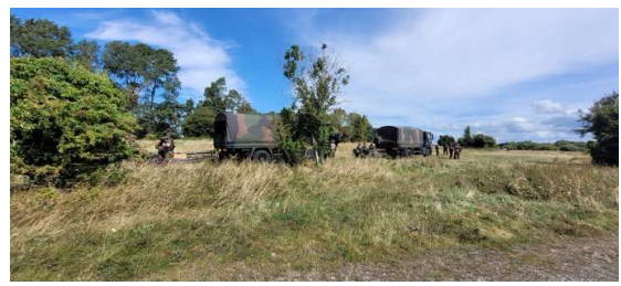
W/E 26 August: Regiment conduced training in Retrograde Operations in the Midlands.