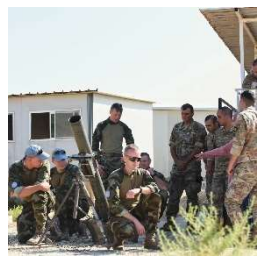
<u>W/E 22 October</u>: Mortar Troop provided training to the Lebanese Armed Forces (LAF) on Artillery capabilities. Combined training and activities with LAF are not only a key tenet of the Unit's mission, but mutually develops understanding and interoperability.