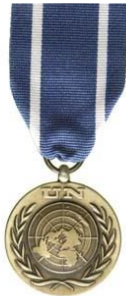
The UNTSO Mission Medal