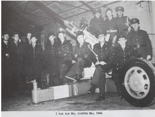
2 Ack Ack Bty, Griffith Bks, 1960.